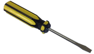
Flathead Screwdriver (not supplied)