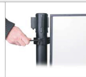
Attach collars to post tops.