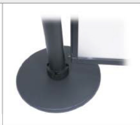
Insert frame lugs into collars.