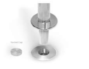
Floor socket for removable mounting.