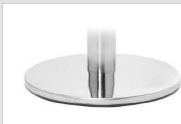
14" Diameter Portable Base