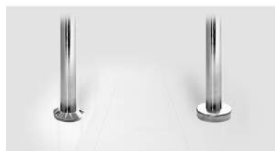
5" flange for permanent surface mounting.