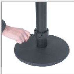
Attach collars to post bottoms.