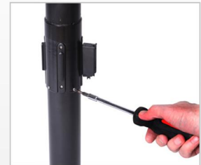
Step 1: Remove post retaining screws