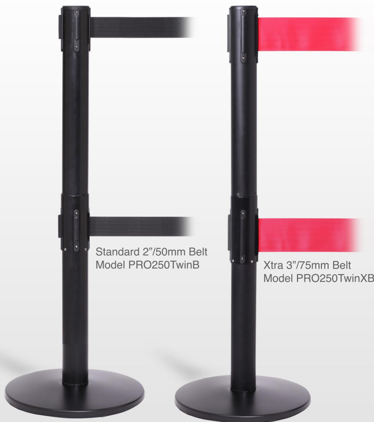
Standard 2"/50mm Belt Model PRO250TwinB

The QueuePro 250 Twin's lower belt restricts pedestrians from ducking under the belt, helps keep children in line and provides guidance for the visually impaired using a cane. The bottom belt makes this stanchion ADA (Americans with Disabilities Act) compliant. This post features a unique two piece post construction which allows the lower belt mechanism to be easily replaced in the field. The Xtra model features a 50% wider belt making a more visible barrier and giving much greater impact to printed logos and messages.