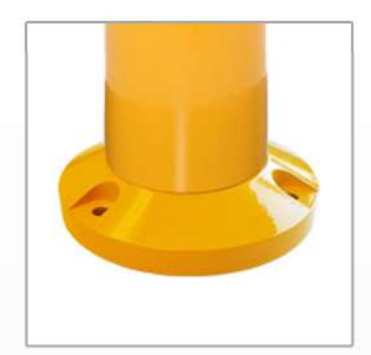
Flange for permanent surface mounting

Our full range of SafetyPro stanchions are available with a fixed base option for creating permanent safety barriers. The fixed base is a 5" diameter flange with three screw holes that allows for permanent surface mounting. Optional decorative flange covers are available.