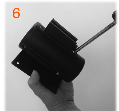
6 Tighten the screws securing the cassette into the housing Note: Do not over tighten as this may affect the belt retraction