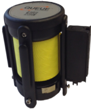
WallMaster 300 2.5" Dia. Replacement Cassette