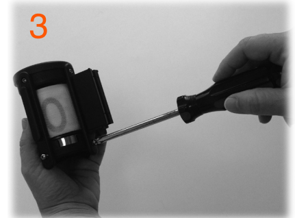
3 Loosen the lower screws slightly on the replacement cassette but take care not to remove them completely otherwise the internal spring will unwind and the belt will not retract