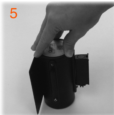
5 Slide the cassette all the way down in the housing