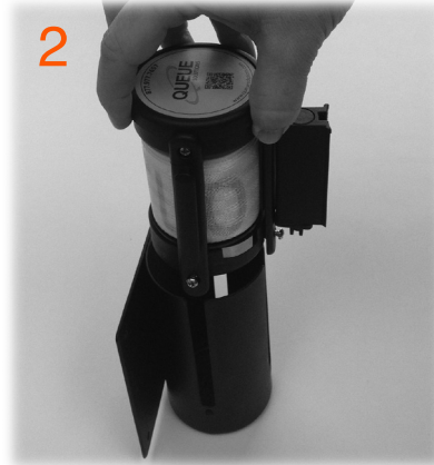
2 Slide the cassette out of the housing