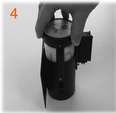
4 Fit the replacement cassette into the slots in the housing