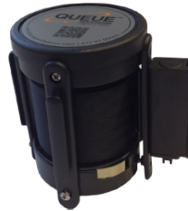
WallMaster 400 3" Dia. Replacement Cassette