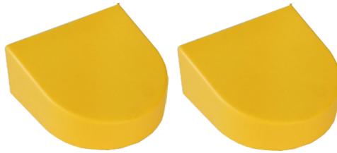
Caps x 2