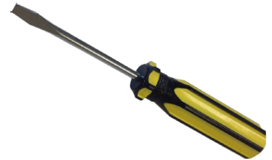
Flathead Screwdriver (not supplied)