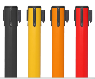
Available in black, yellow, orange, and red.