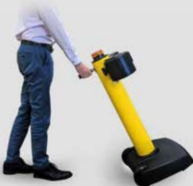
Easy to move and set up