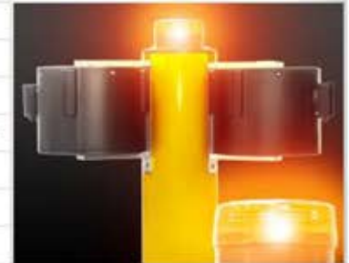
Flashing light option for low light visibility.